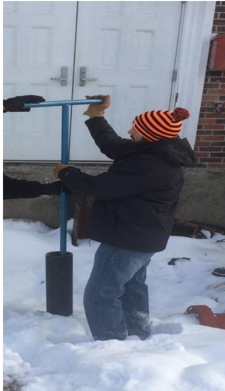
Pipe Commissioning on January 10, 2017

The testing of the last segment of the forcemain was completed on December 31, 2016. The pipeline was commissioned on Tuesday January 10, 2017. Albanese D&S along with the Plymouth Sewer Department completed draining the raw sewerage from the bypass pipes into the Water Street pump station wetwell and started flushing of the bypass pipes using the plant treated effluent water circulating it back into the plant in an effort to flush the bypass. All work was completed in close coordination with Veolia personnel to ensure that plant operation continues while flushing the pipeline. The flushing of the bypass was completed on January 14, 2017. Several taps were installed in the bypass pipes at low points to allow the crew to drain and collect the remaining liquid in the pipelines before pipe dismantling and removal.